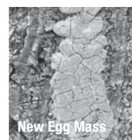
New Egg Mass