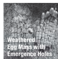
Weathered Egg Mass with Emergence Holes